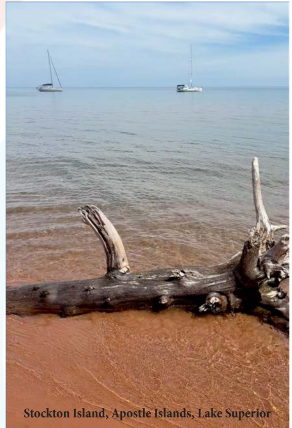
Stockton Island, Apostle Islands, Lake Superior

• Visit www.solosailors.org for updates and more events.