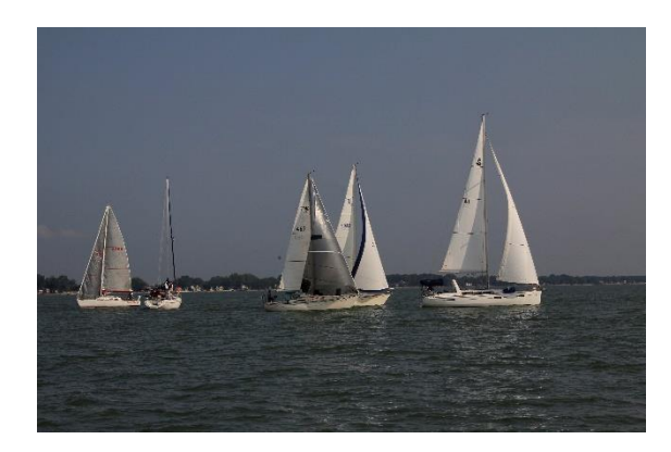
Second wave of starters at the Committee Boat.