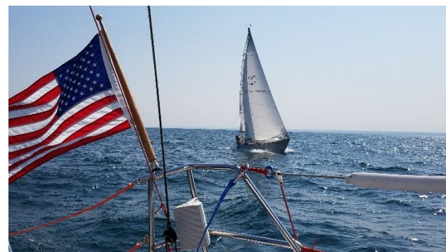
Schock n' All and Walkure II enjoy the sail home.