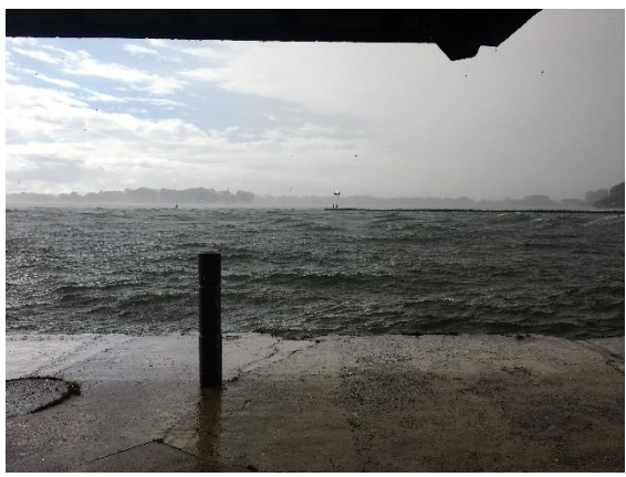
Squall hits Just as Living A Dream finishes.