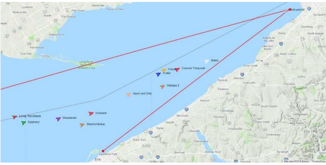
Monday Morning at 0600 showed everyone pointing more or less towards Buffalo. Shock n' All is at the Seneca Shoal buoy.

whole boat in spinnaker. It took me an anxious half-hour to get the sail down and get a jib back up."