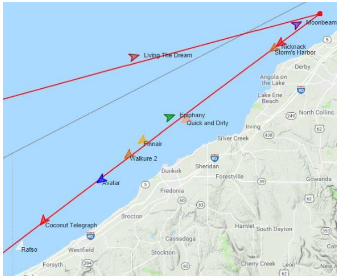
Monday night at 2300 the fleet stretches from the PA line to Buffalo.

Epiphany's log reads: "I had to double reef the main sail. Just after midnight I learned Living the dream, Lawrence Visnic was about a quarter mile away. He rounded Seneca shoal light at 128am and I went around at 159am. The Seneca shoal light is very difficult to see and you have to use your GPS to find it. There are so many background red blinking lights with the windmills in the background.