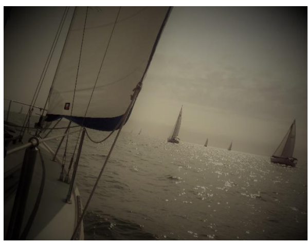
Living a Dream watches the fleet full away.