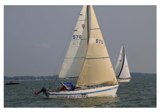
Blair Arden going for challenge #42.