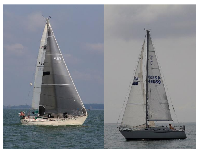
Walkure II to port and Finnair to Starboard

sailor and our boats have identical ratings, so I always use him as a guide to how well I'm sailing, happy when I can just keep up with him. It took me several hours to catch him, and that was the story of the whole race. He and I caught and passed each other several times over the course of the next 2 days."