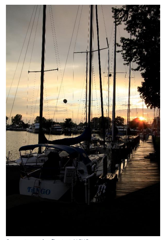
Sun sets on the fleet at NCYC