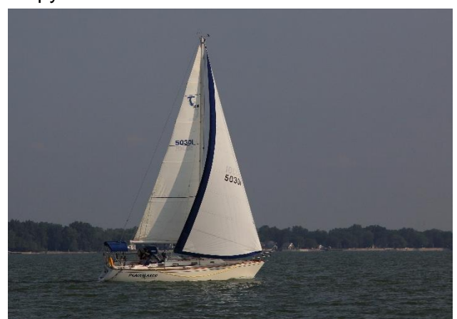
PeaceMaker during more peaceful times at the start.

While the back of the fleet struggled more on a beat to get past the shoal, the lead boats while favoring the north were heading towards Roundeau with Russ Krock being the only boat to clear Roundeau without tacking. With the bend in the Canadian shore and continuous wind turbine lights on a clear night, the progress seemed slow even though we sailed in hull speed conditions through a lumpy Lake Erie.