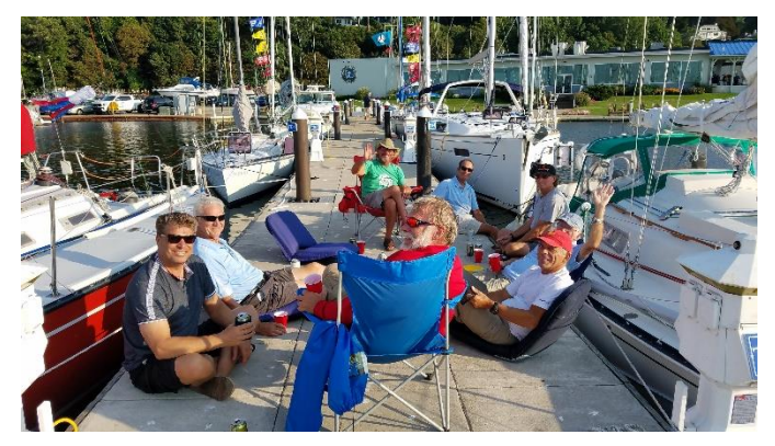
Skippers wind down on the dock before the Thursday Night Party.

For the rest it was time for another trip to Avantis for breakfast. All the remaining boats were now on the guest dock as the high water allowed the deeper draft boats to clear the stone hump that can be an issue.