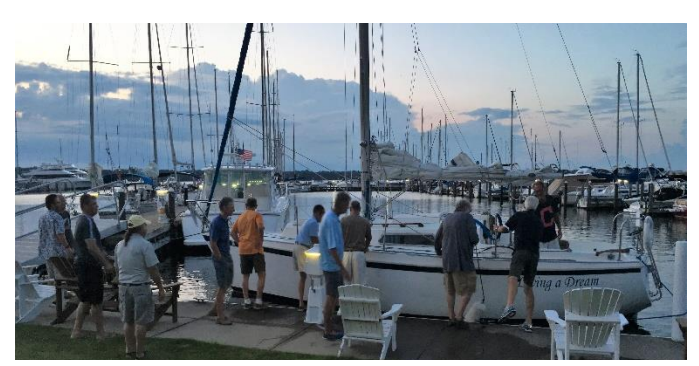
Everyone lends a hand getting Living A Dream tied up. Pressure from storm cells effect water heights in Lake Erie's harbors and it was about 3 inches from flooding the basin wall.

At that time everyone was gathering in the EYC dining room for the traditional Tuesday evening dinner. Just as the food was coming out Lawrence entered the EYC basin and it was time to get him tied up. The guest dock was full and the best place to put him was on the basin wall. Problem was, Lake Erie was high and the pressure from the weather left only a couple of inches of wall. With all his dock lines we were able to tie him off the wall from other docks. Time to get back to dinner.