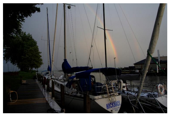
A Brilliant Rainbow filled the Sky

After dinner a quick squall went through and everyone hoped it would be the last and the cold front could finally move through. As the sun was going down it lit a Rainbow that went from the US to Canada.