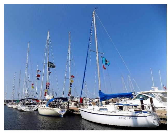
Fleet docked at the EYC Guest Dock.