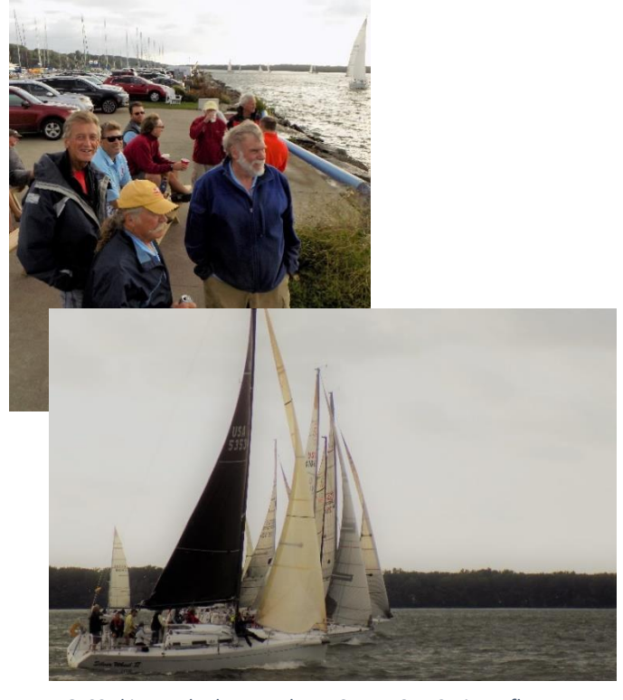
GLSS skippers look on as the EYC Beer Can Series A fleet starts about 100 feet off the seawall.

After the luncheon and a group shot of the Skippers, plans were discussed for the return deliveries. With westerly winds still blowing 15 to 20 everyone felt EYC would be a nice place to spend the night. Besides it was race night on the bay with the start just off the basin wall. With 15 to 20 knot winds and a downwind start it was quite entertaining as a crowd gathered on the wall for the entertainment. In the middle of the course the Brig Niagara was anchored waiting its next adventure. This is how sailboat racing should be done.