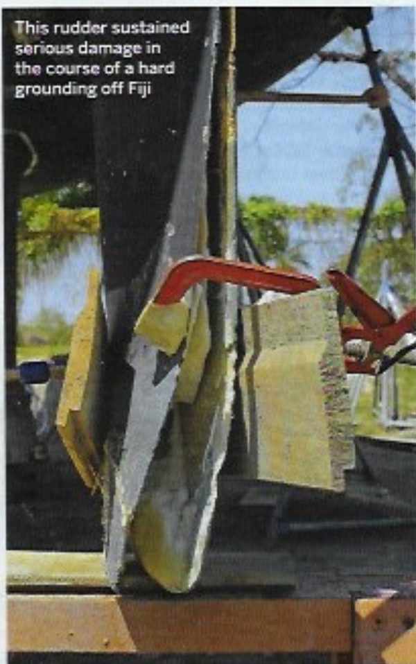
This rudder sustained serious damage in the course of a hard grounding off Fiji