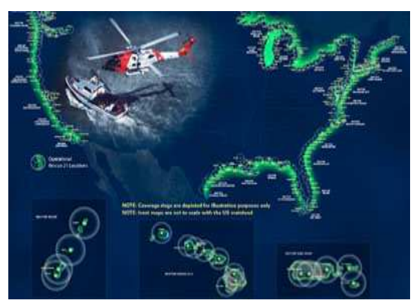
Covering approximately 42,000 miles of coastline, Rescue 21 has played a role in more than 47,000 Coast Guard search and rescue operations to date.

Nine years after work began at Group Atlantic City, N.J., the Coast Guard's Rescue 21 project crossed a major milestone in June 2012 with acceptance at Sector Guam, making it fully operational along the coastlines of the continental United States (CONUS), the Great Lakes, Hawaii, and the territories of Puerto Rico, Guam, the U.S. Virgin Islands and the Northern Mariana Islands. Looking to the future, the project begins its final phase with plans to develop capability for Alaska and for the Western Rivers, which includes the Mississippi and Ohio River Valleys.