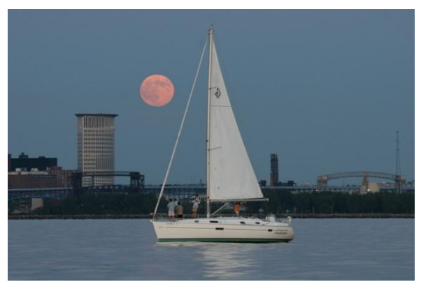
On a quiet evening, the full moon rises. The other boat went back in and I enjoyed an 8 knot offshore breeze that filled in for 2 more hours.