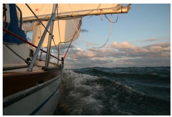
Nicknack surfs at over 12 knots before the reef goes in.

During the 2000 radio check-in I was the first boat to catch a new burst of breeze. After an out of control surfing broach the Genoa went rolling up and when things settled down the wind was over 30k apparent and I was surfing at over 12 knots. As night was coming fast my next task was to reef the mainsail.