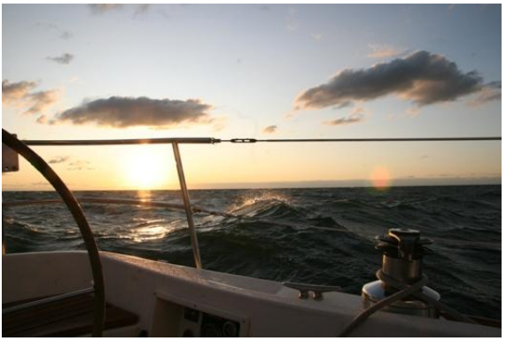
Putting Pelee Point behind us the waves build bigger in Lake Erie's Central Basin.

After sponsoring 4 other Great Lakes Challenges in 2009, the final GLSS Challenge of the season was the 3<sup>rd</sup> Annual Lake Erie Solo Challenge starting on August 29<sup>th</sup>. The course is from North Cape Yacht Club between Toledo and Detroit to Buffalo, rounding the Seneca Shoal Buoy, and finishing at Presque Isle in Erie. 14 skippers gathered to challenge the 271nm Lake Erie course. While strong NE winds propelled everyone to NCYC, the forecast was for strong westerly winds for the start on Saturday combined with cold weather. The wind went from NE at 15k Friday night to 8-10k from the west Saturday morning for the 1000 start. The winds and seas continued to build all day as the boats headed for the Pele Passage dead downwind. Running at a constant 7-9 knots with 15-20 knots of apparent wind, all the boats seemed to enjoy the surfing conditions as they made their way through the central basin with plenty of daylight.