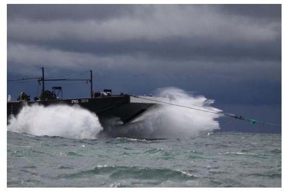
A tug towing this barge struggled upwind while we enjoyed continued surfing downwind. The dark line of clouds were the remains of the cold front that passed through overnight.

The most frequent question I get singlehanded sailing is "How do you sleep?" First, I run an alarm system (Watch Commander) that cycles every 3-30 minutes. I run this 24 hours a day to make sure I never doze too long and it also keeps me doing certain activities like keeping a log. As the temperature dropped into the 40s it was time to get below and catch some 20 minute naps as Nicknack continued to handle the lake just fine and shipping traffic was nowhere to be seen. At one point 3 freighters came in sight but they were soon gone. The 3 skippers with auto helm problems continued to sail east and had to steer by hand. By morning they were all exhausted and decided to head for Erie and as dawn progressed it became obvious just how deep the cold front had gotten. A dark line of clouds sat over the south shore of Lake Erie with what appeared to be waterspouts and heavy rain. The fleet heading to Buffalo was well to the north but the guys heading for Erie had to go right through it.